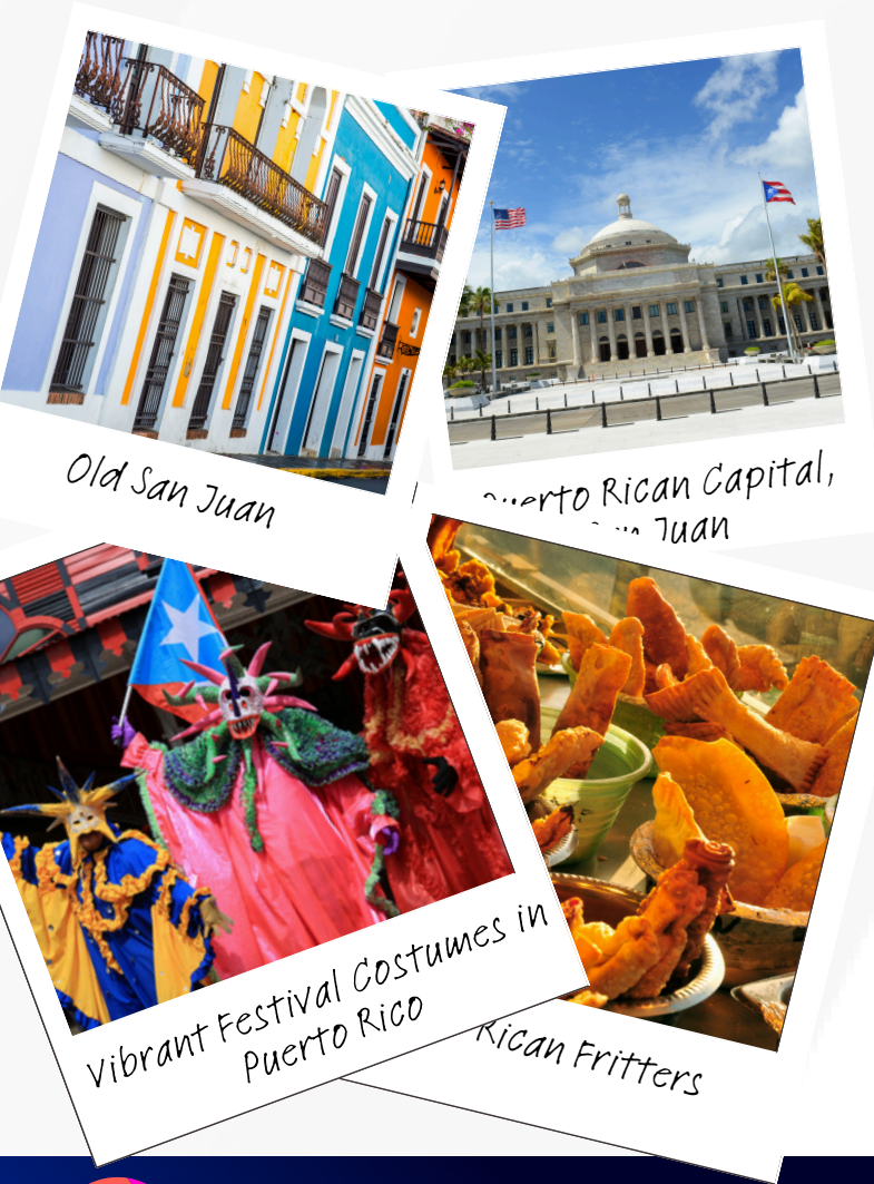
Old San Juan

Combined with its historic architecture, walkable streets, and accessible attractions, San Juan in January delivers a dependable and engaging destination for cruise guests.