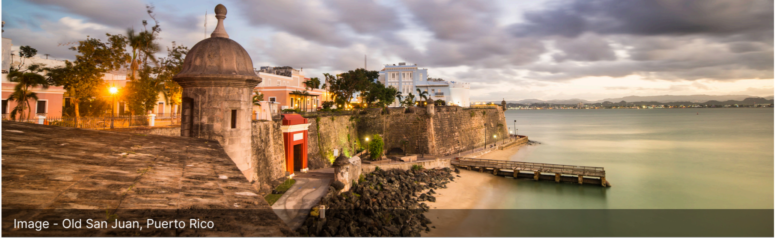
Image - Old San Juan, Puerto Rico