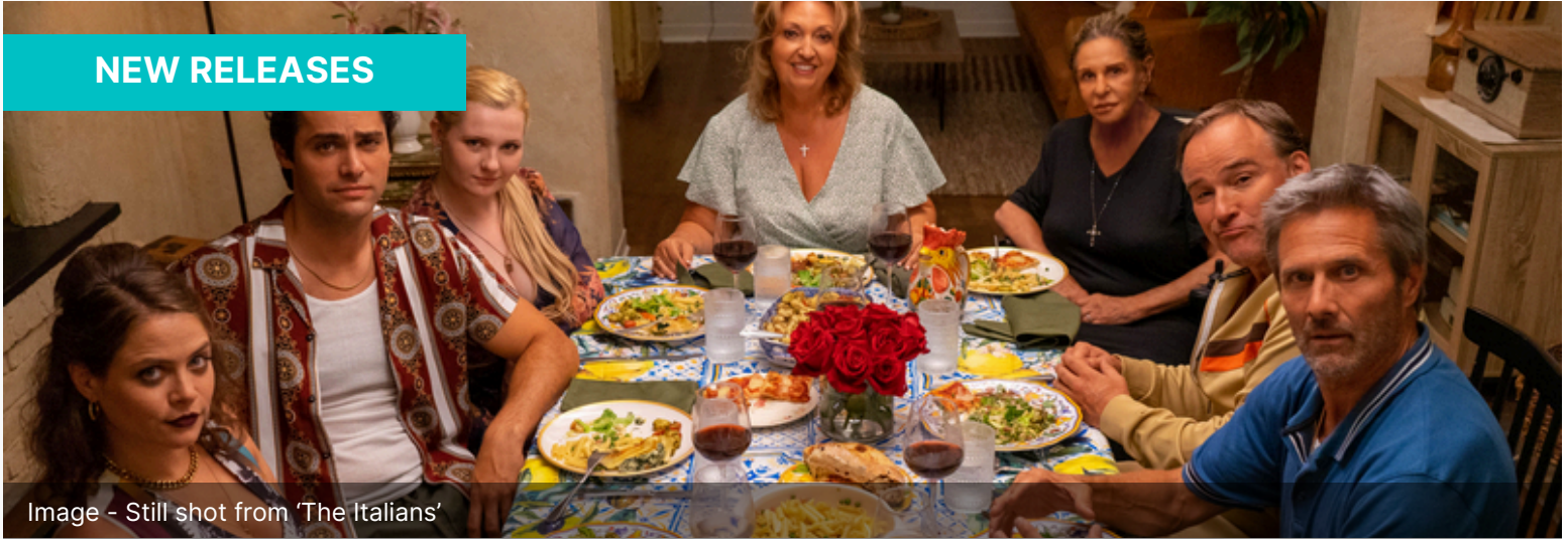
Image - Still shot from 'The Italians'